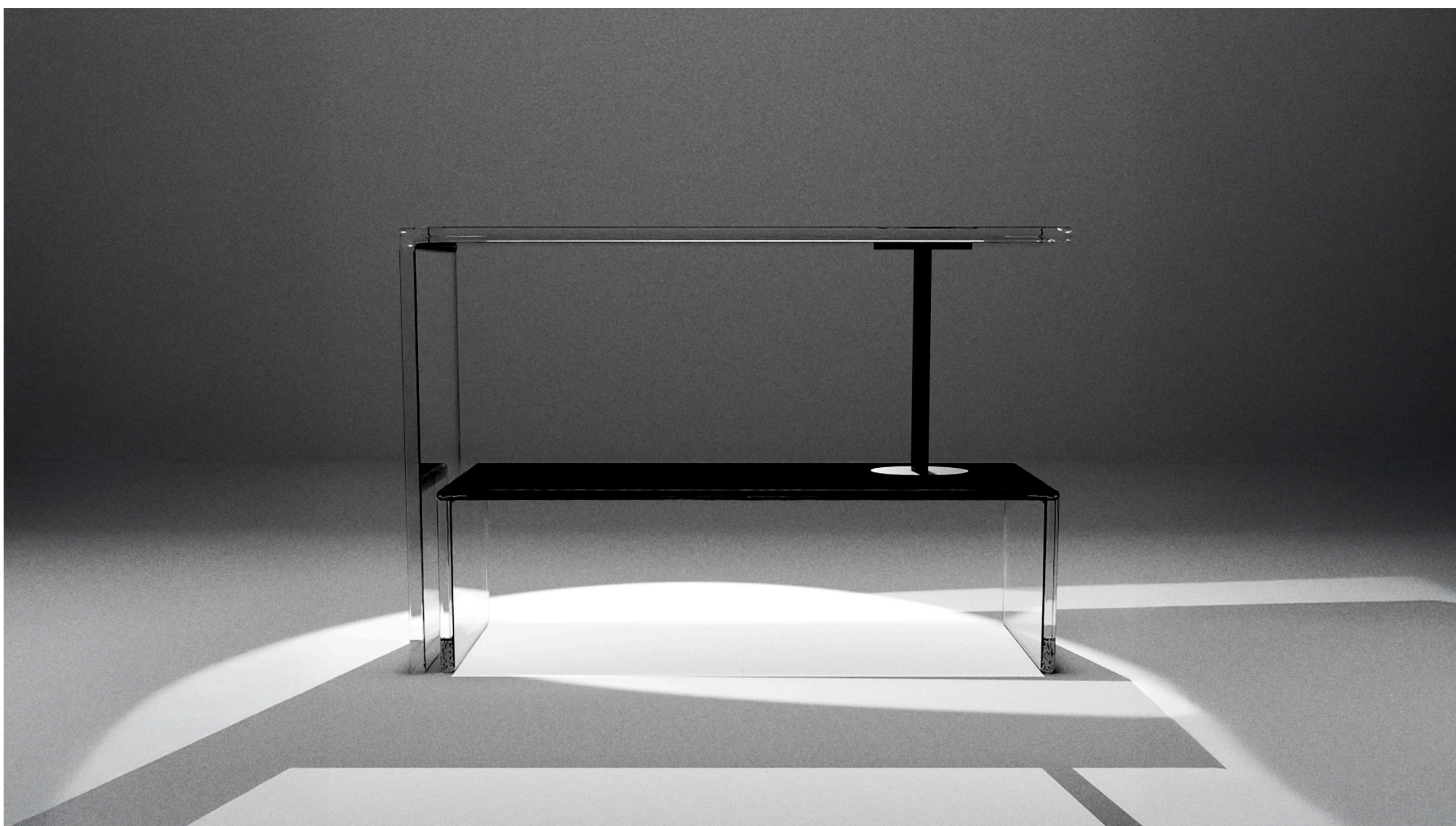
Tavolino da caffè Basello // Re-design Coffee table Basello // Re-design

Casch is both an object of design and a practical tool, combining everyday usability with artistic character. The glossy, seamless finish highlights its sculptural quality, making it as much a décor element as a functional lamp.