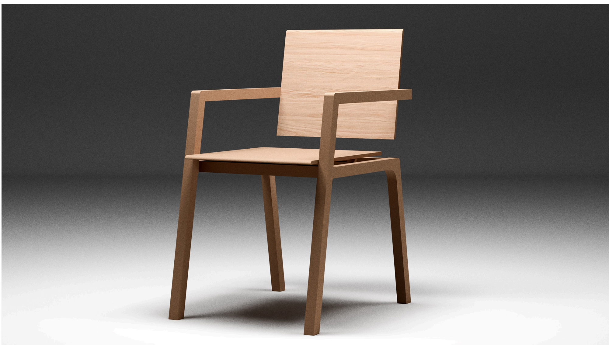
Poltroncina Palermo Armchair Palermo