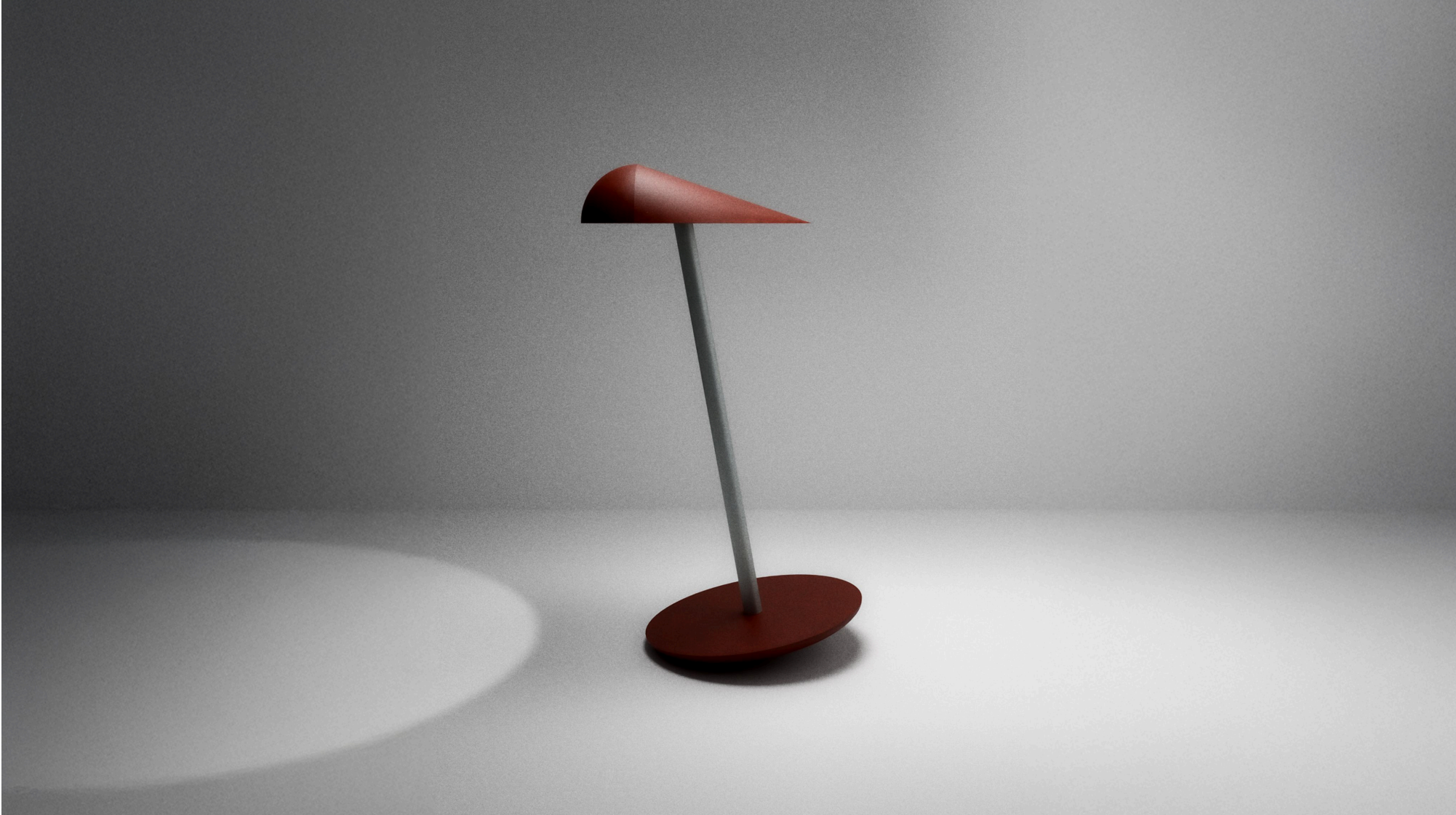
Lampada da tavolo - Sintetica Table lamp - Sintetica

This redesign is not only a functional coffee table but also a statement of how timeless design can evolve through material experimentation.